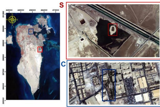
Fig. 1 Map of Bahrain showing study (S) and control (C) sites